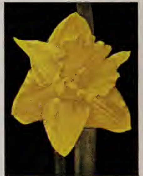
NARCISSUS KING ALFRED